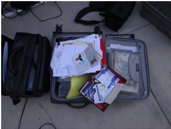
Recovered stolen property from LV