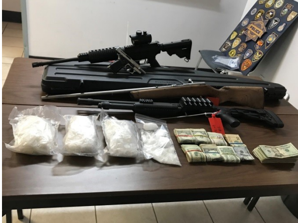
Methamphetamine, firearms & US currency